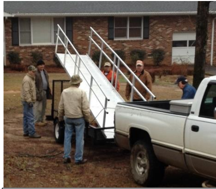
Photo above: Delivering 2 sections of portable ramp to be used at site for approximately 3 months.